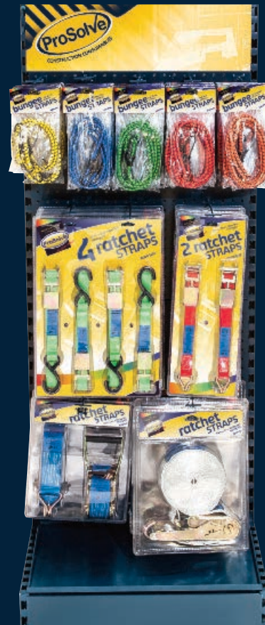
Bungee & Ratchet Stand