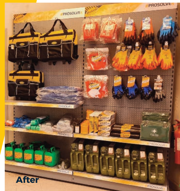
Keyline Milton Keynes