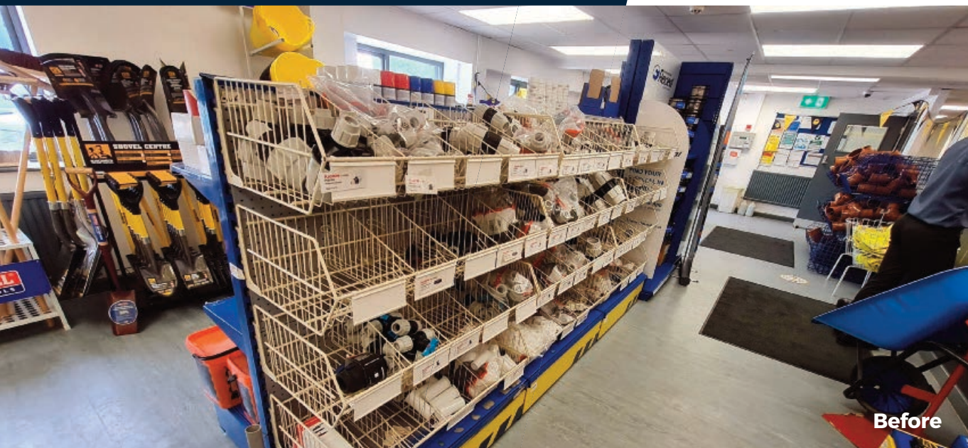
Burdens West Bromwich