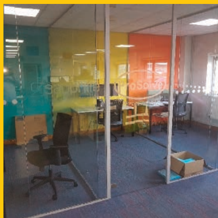
ProSolve HQ Before