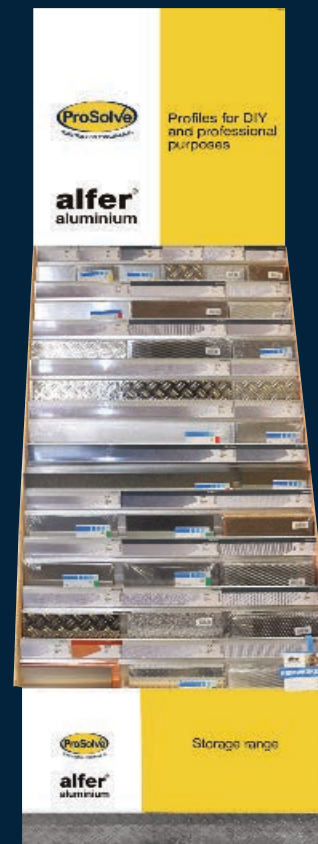
Metal Sheet Stand