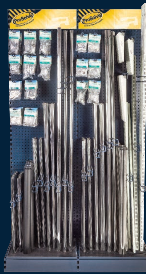
Chrome Stand & Mixed Tube Stand