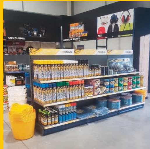
Jewson Civils Frazer Wednesbury