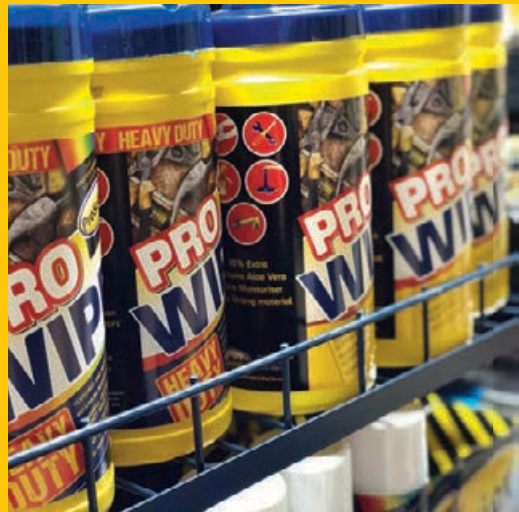
Civils & Lintels Durham